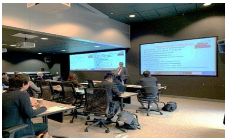
A scene from the workshop