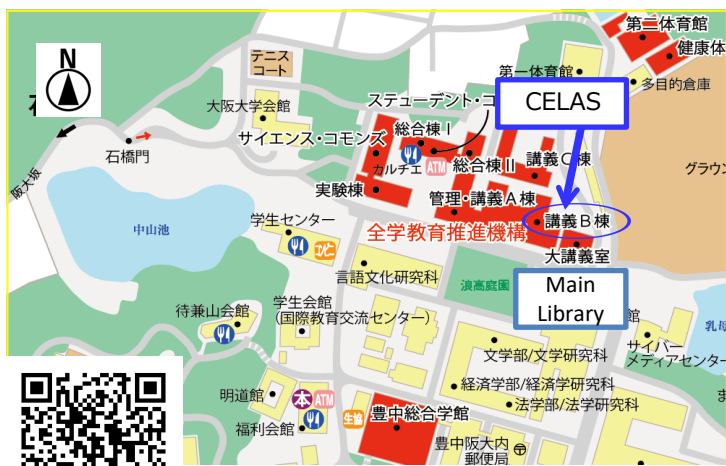
Toyonaka Campus Map