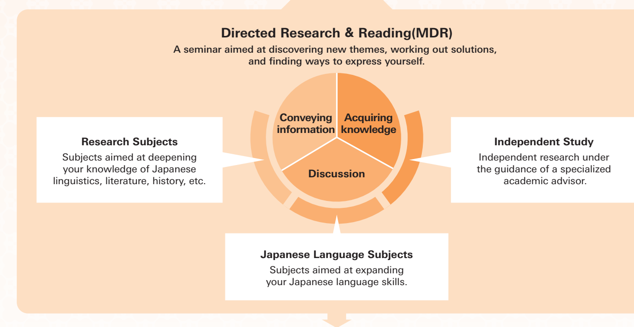
Nearly 160 credit-bearing subjects

Develop core skills of conveying information, acquiring knowledge, and discussion