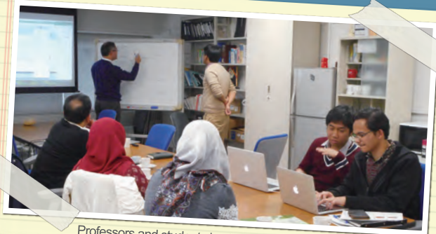
Professors and students having an interactive scientific discussion