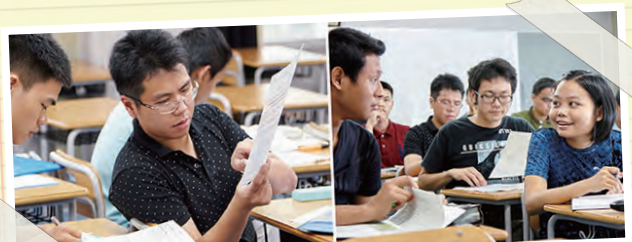
International students studying in a classroom