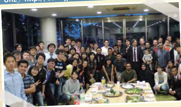
Welcome party for international students