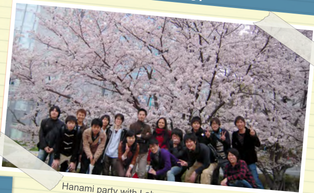
Hanami party with Laboratory members in Suita Campus