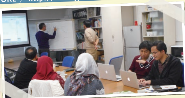
Professors and students having an interactive scientific discussion