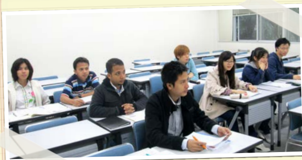
CSC students from various countries