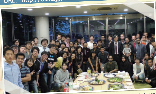
Welcome party for international students