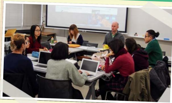
HUS students in a seminar