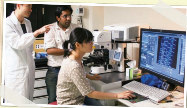
Research work using data