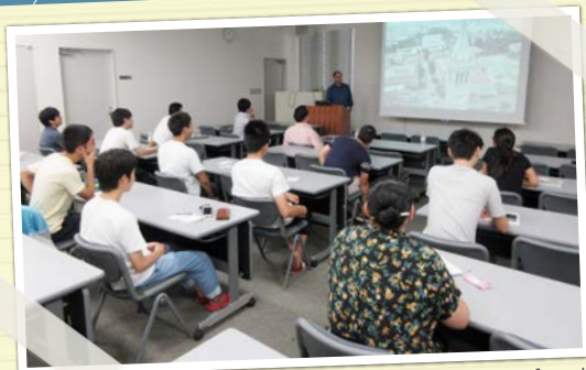
Lecture by a visiting professor from the US