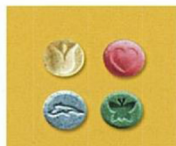
MDMA (Ecstasy, Batsu)