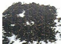
Cannabis (Happa, Choco)