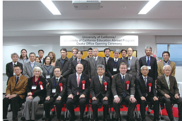
Opening Ceremony of the UC/UCEAP Osaka Office

On 3 rd December 2014, the UC/UCEAP Osaka Office was opened in the Interdisciplinary Research Building on OU's Toyonaka campus. The office was established as a central base to enhance student exchange between UC and its partner universities in western Japan, including OU, to plan exchange programs, and organize lectures conducted by UC faculty for OU students.