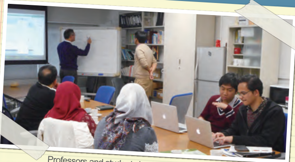
Professors and students having an interactive scientific discussion