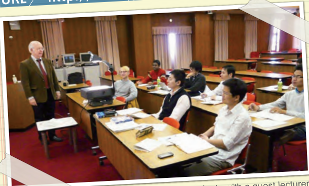
IPC students with a guest lecturer