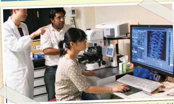
Research work using data