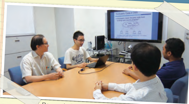
Research discussion with students and faculty members