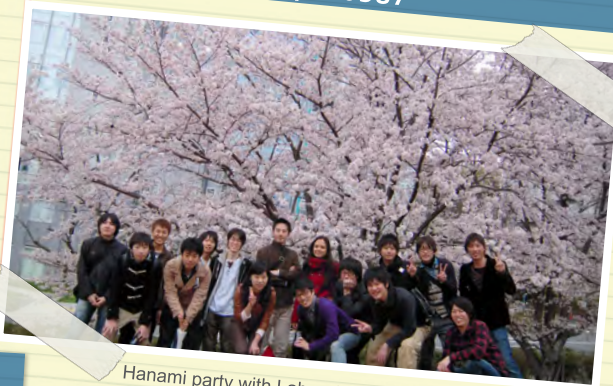
Hanami party with Laboratory members in Suita Campus