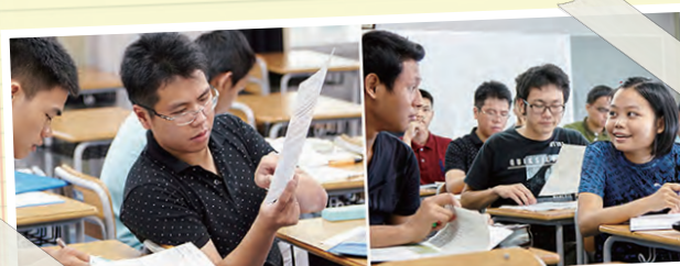
International students studying in a classroom