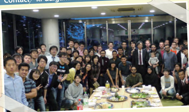
Welcome party for international students

Contact / ki-daigakuin@office.osaka-u.ac.jp