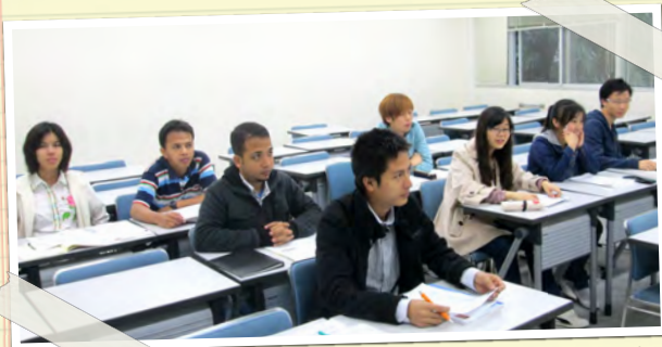
CSC students from various countries