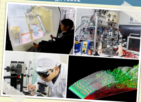
A variety of research topics