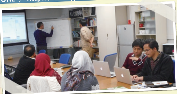
Professors and students having an interactive scientific discussion