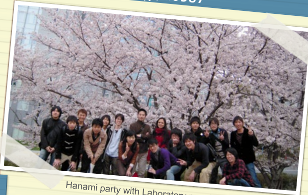
Hanami party with Laboratory members in Suita Campus