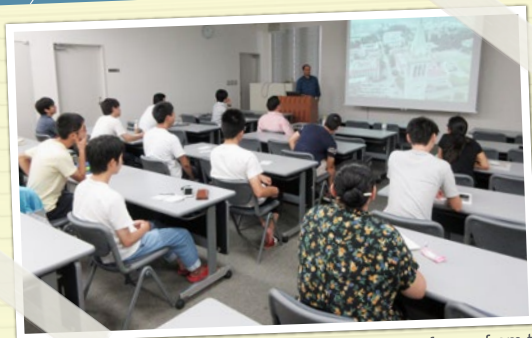
Lecture by a visiting professor from the US