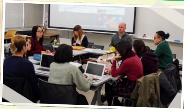
HUS students in a seminar