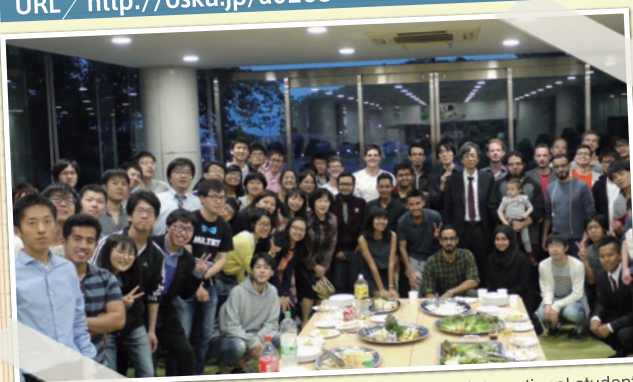
Welcome party for international students