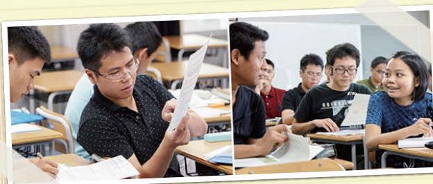
International students studying in a classroom