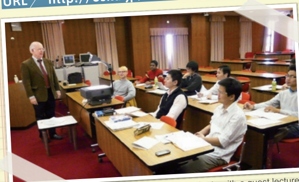
IPC students with a guest lecturer