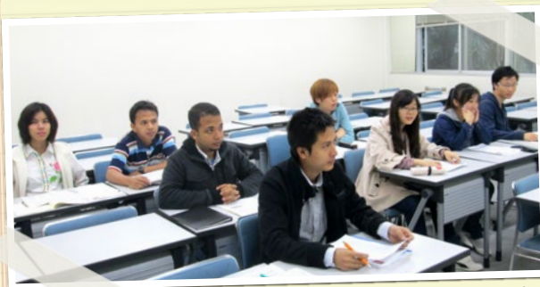
CSC students from various countries