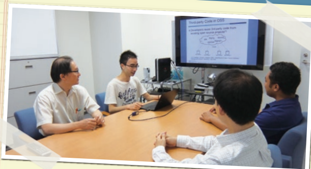
Research discussion with students and faculty members