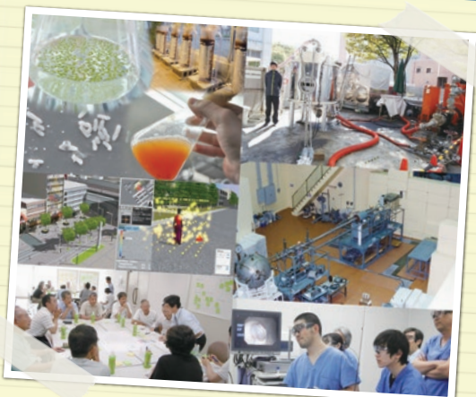
Research in the International Program of Sustainable Energy and Environmental Engineering