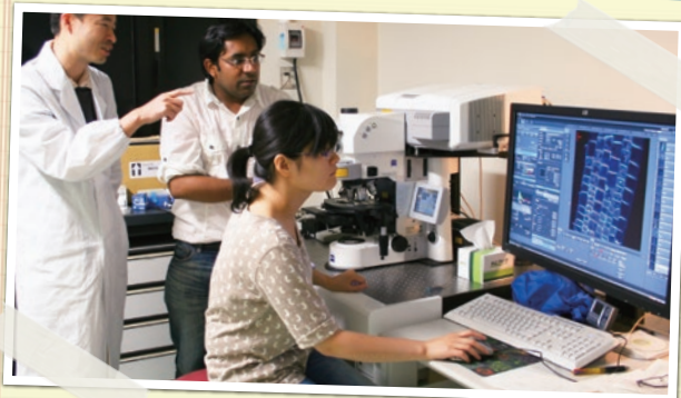
Research work using data