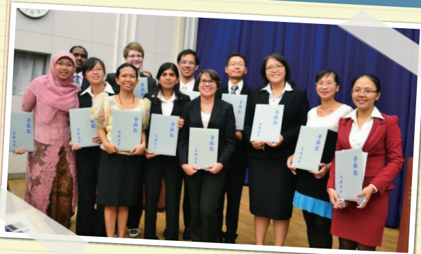
Graduation day of the program